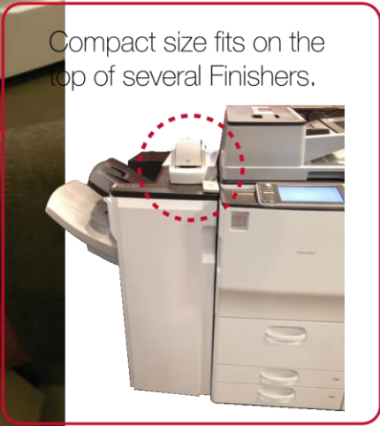
Compact size fits on the top of several Finishers.