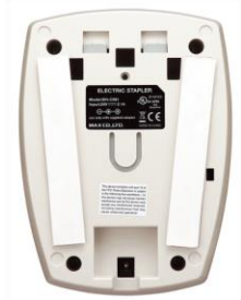
Fastenings strips affix the device firmly to any level surface.