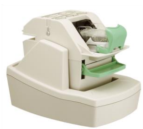
Staple reloading is simple and takes just seconds