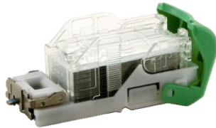
High capacity staple refills -5000 per unit