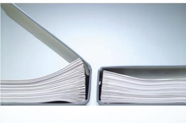
Flat clinch staple closes flat, papers stack neatly and evenly.